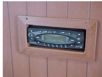
New Stereo System

FIELD SERVICE RECOMMENDATION: Replace the Magnadyne stereo with the new Gecko brand. A retrofit kit is available to replace the defective Magnadyne stereo. The kit includes a Gecko stereo/CD player, remote, cabinet trim, illustrated instructions, and special tools. The kit can be ordered through our parts and service department. The part numbers are 303465C for Cherry or 303465G for Cherry Gray cabinet panels.