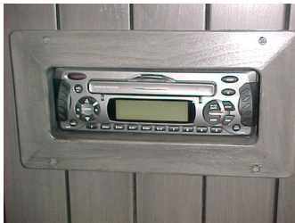
Old Stereo System

CORRECTIVE ACTION: We have switched to Gecko brand stereos.